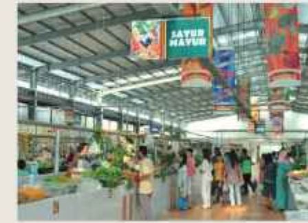
Market Pasar Modern