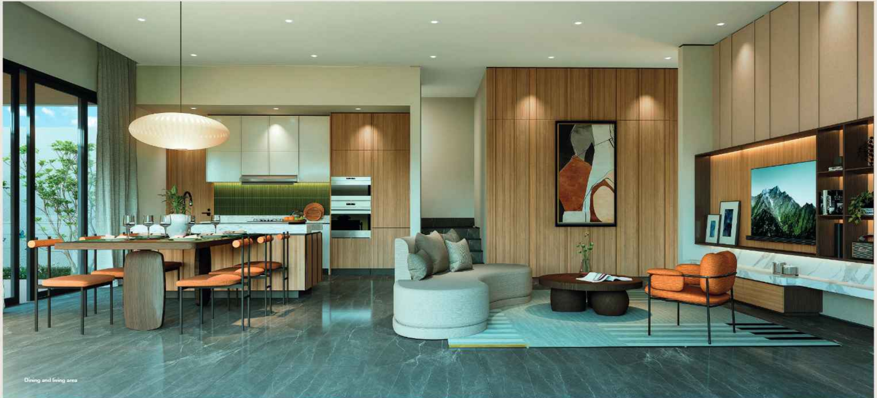
Dining and living area