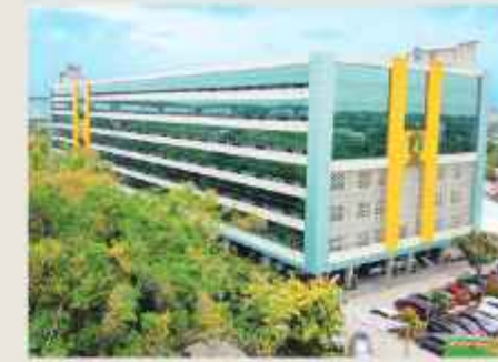
Health Eka Hospital RS Hermina