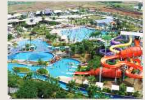
Entertainment Go! Wet Waterpark