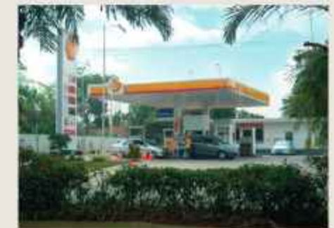
Gas Station Shell BP