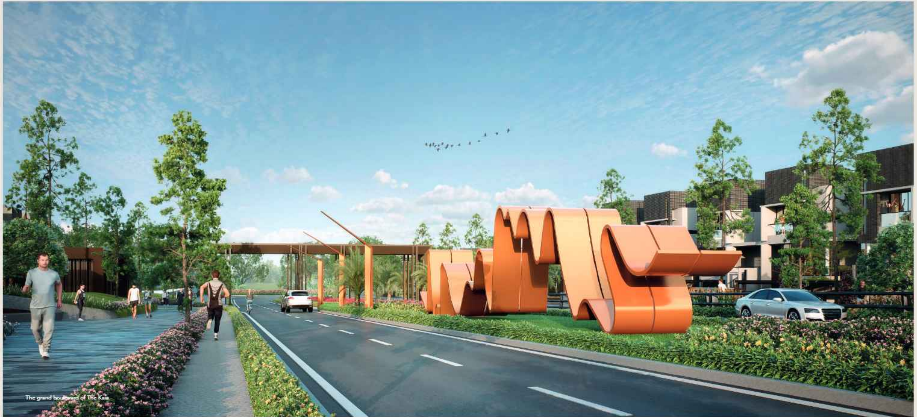
The grand boulevard of The Kaia

Stroll along the Grand Boulevard of The Kaia and experience the refreshing embrace of nature, a serene escape in the middle of the vibrant heartbeat of Grand Wisata.