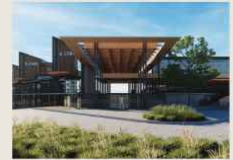
Sport Premium Clubhouse