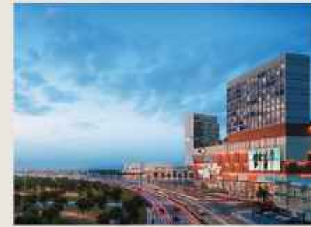
Mall Living World