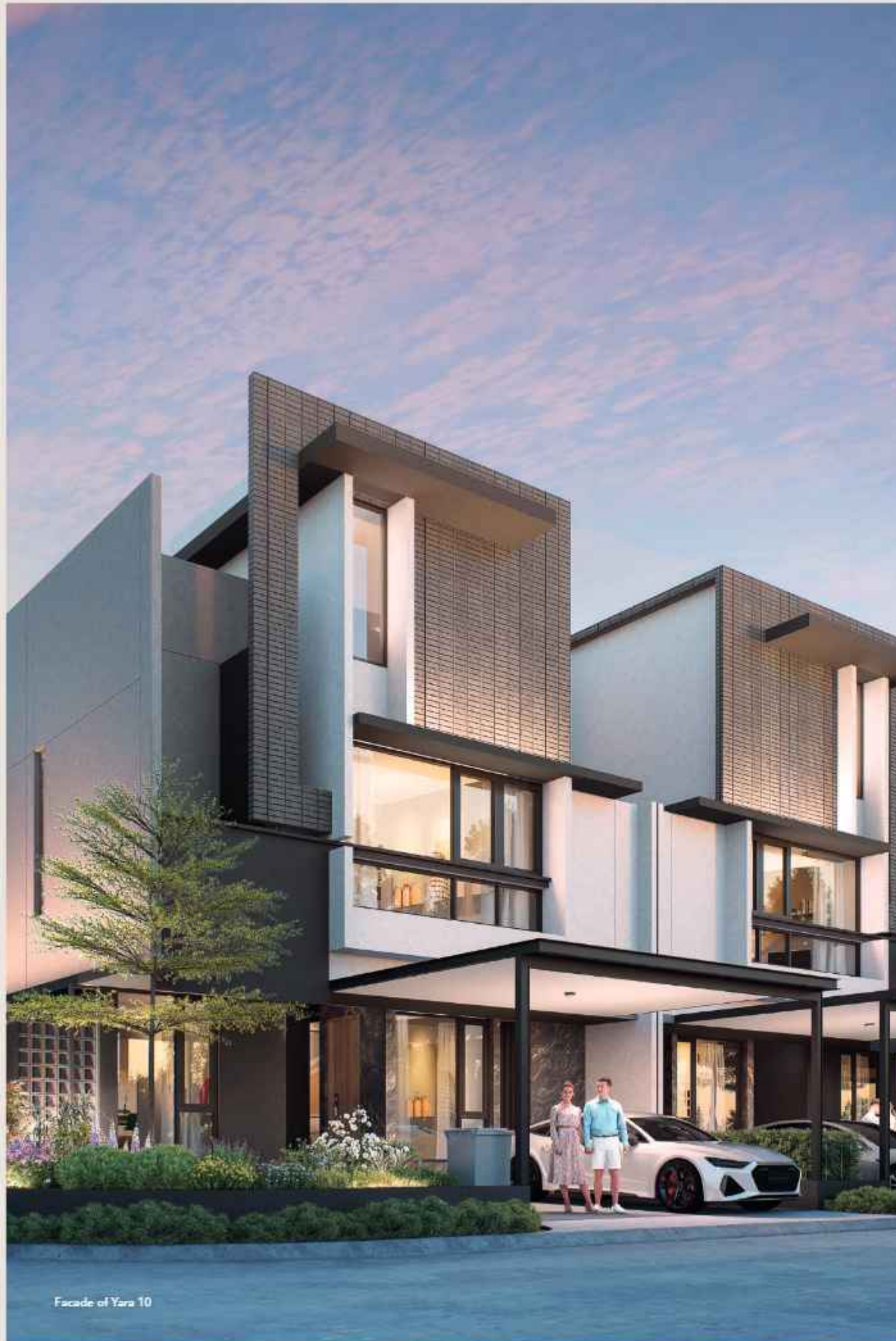
Facade of Yara 10

Yara 10 invites you to discover a home that echoes with joy and comfort. With a spacious land area of 220 square meters, four bedrooms, five bathrooms, and a multi-function room, Yara 10 is crafted for a harmonious living experience. This residence seamlessly blends modern design with thoughtful features, creating a space where joy and functionality coexist. Welcome to Yara 10 – where your living experience resonates with happiness and fulfillment.