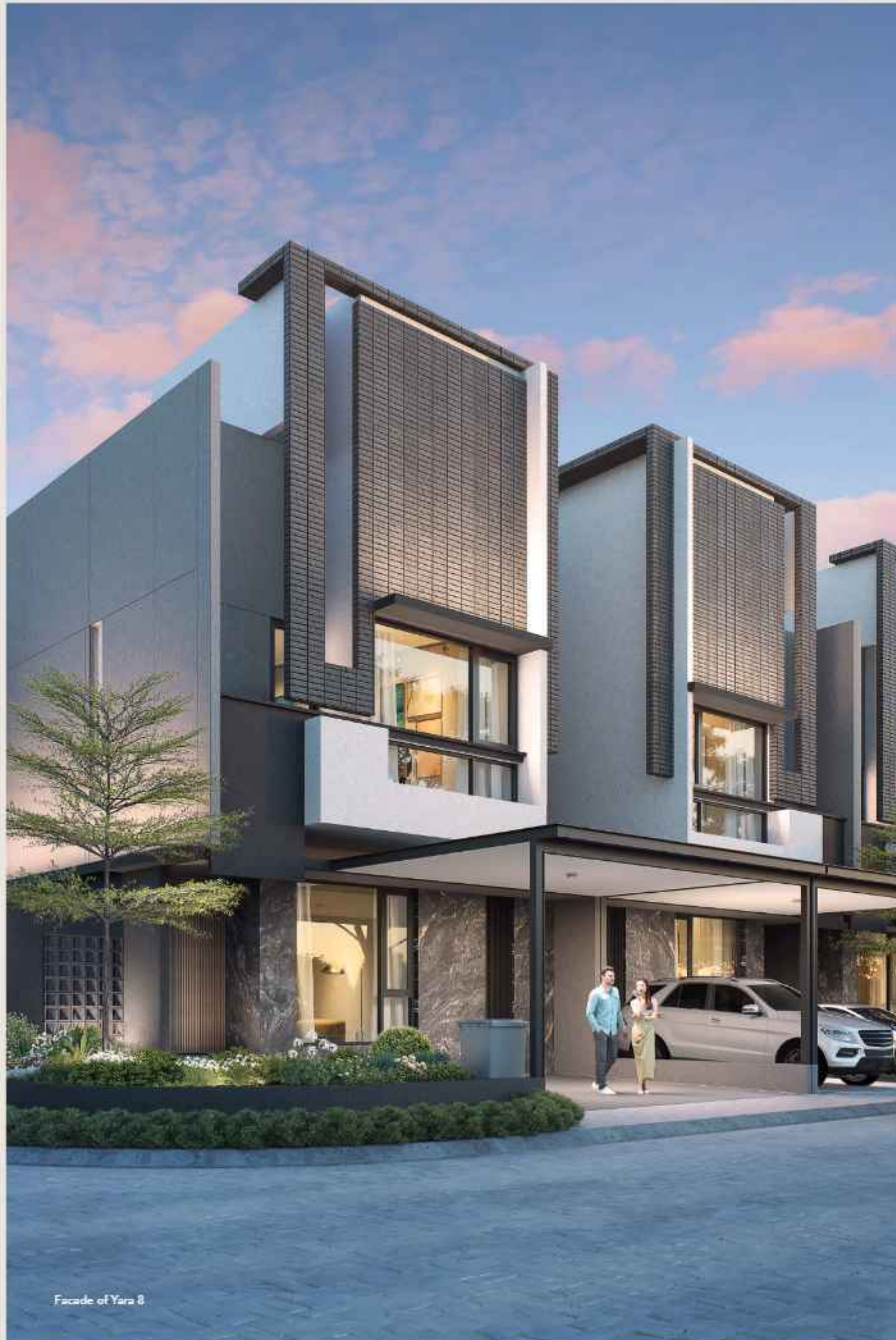
Facade of Yara 8

Yara 8 is more than just a house; it's a home that has everything you need. With a spacious land area of 144 square meters, four bedrooms, a versatile multi-purpose room, and four bathrooms, Yara 8 is designed for modern living. Experience the perfect blend of elegance and comfort, where every detail is carefully considered. This is your invitation to a home that truly has it all – welcome to Yara 8.