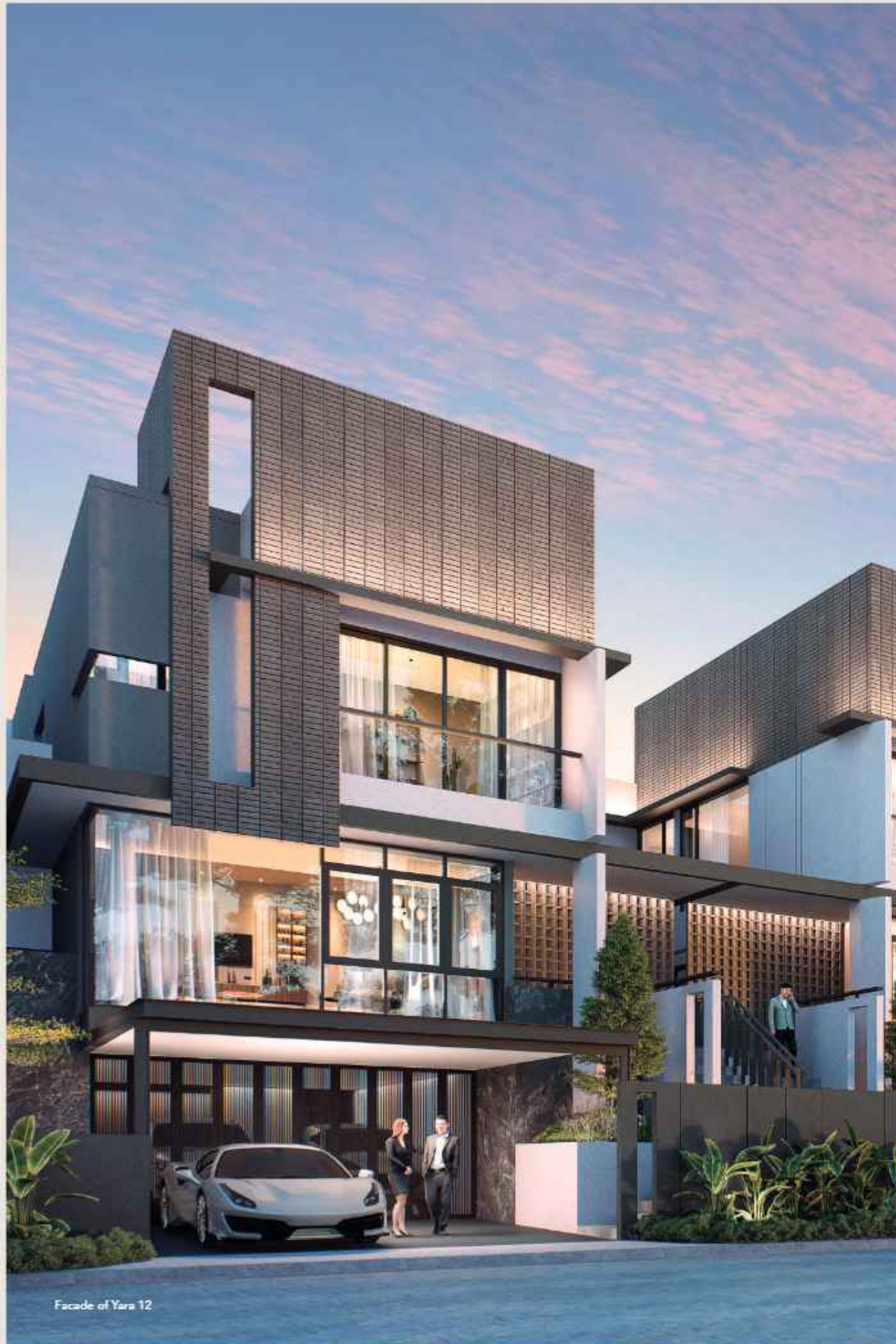
Facade of Yara 12

Yara 12 beckons you to a realm of sophistication and comfort with its sprawling land area of 240 square meters. Boasting four bedrooms, five bathrooms, and a dedicated garage, Yara 12 is a residence that encapsulates luxury in every detail. From the carefully curated interiors to the thoughtfully designed spaces, this home is a testament to exquisite living. Immerse yourself in the pinnacle of elegance and functionality at Yara 12 – where luxury is woven into every aspect. Welcome to a residence where opulence meets meticulous detailing.