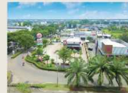
Shop & Dining Cafe Walk