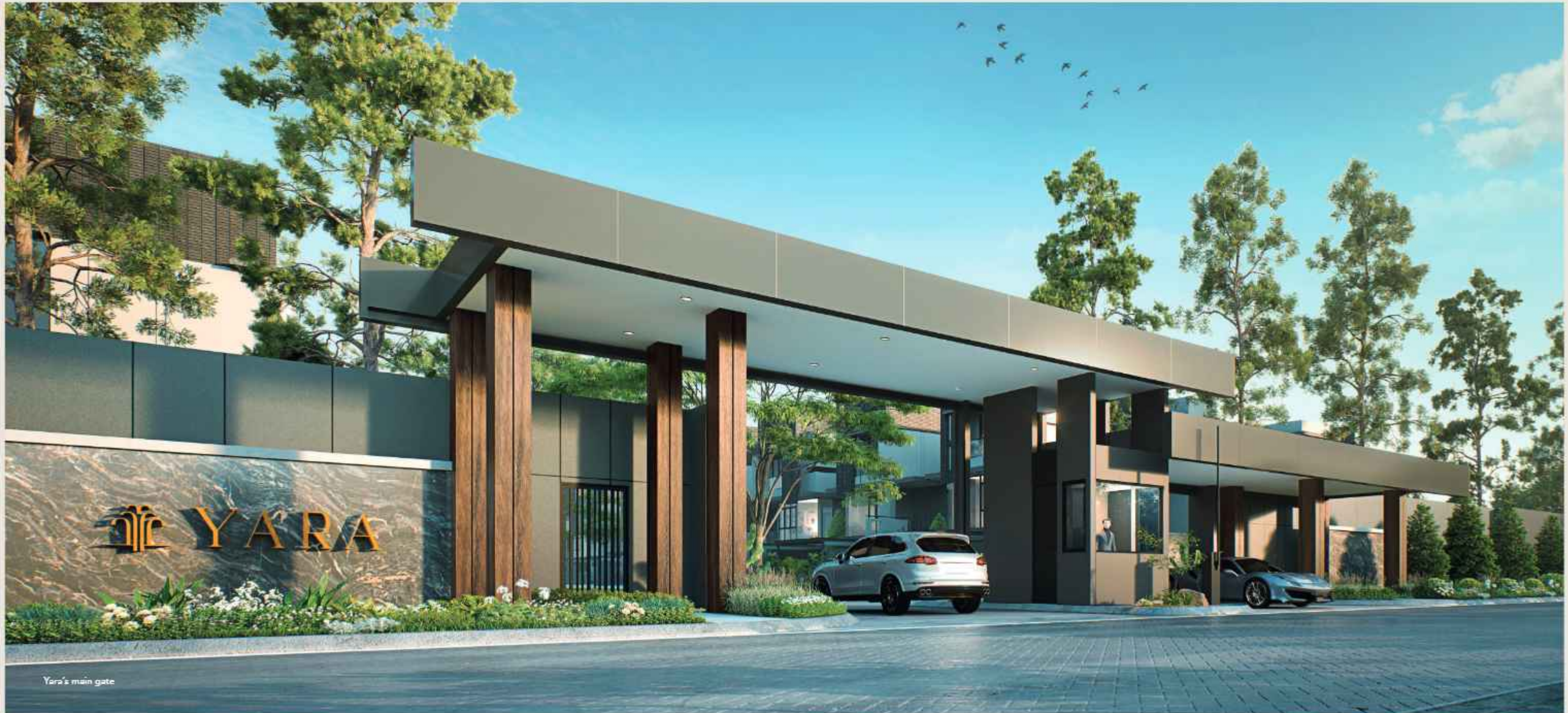
Yara's main gate

Yara is our first premium development inside The Kaia. Located at the forefront of The Kaia's gate to ensure easy access and security.