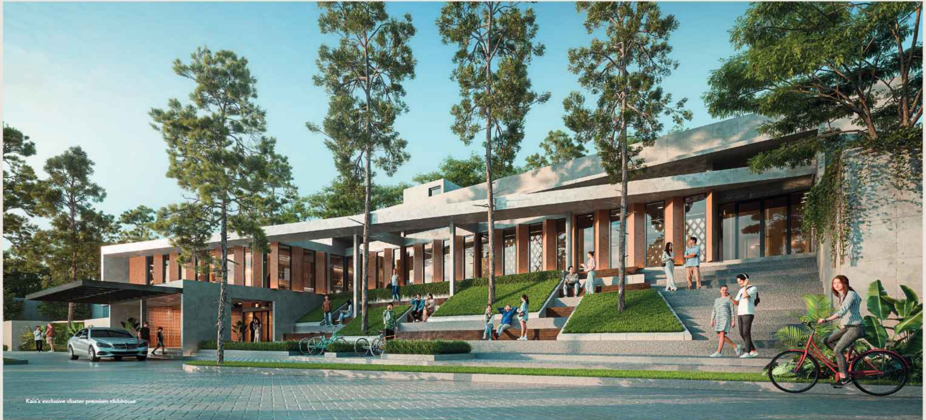
Kaia's exclusive cluster premium clubhouse

The Kaia Clubhouse serves as the ultimate hangout spot, fostering community connections and relaxation for residents.