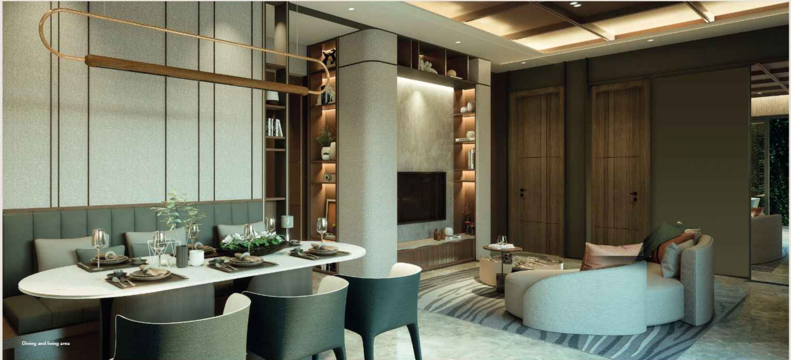
Dining and living area

Indulge in a healthier lifestyle as abundant sunlight and fresh air grace the dining and living area.