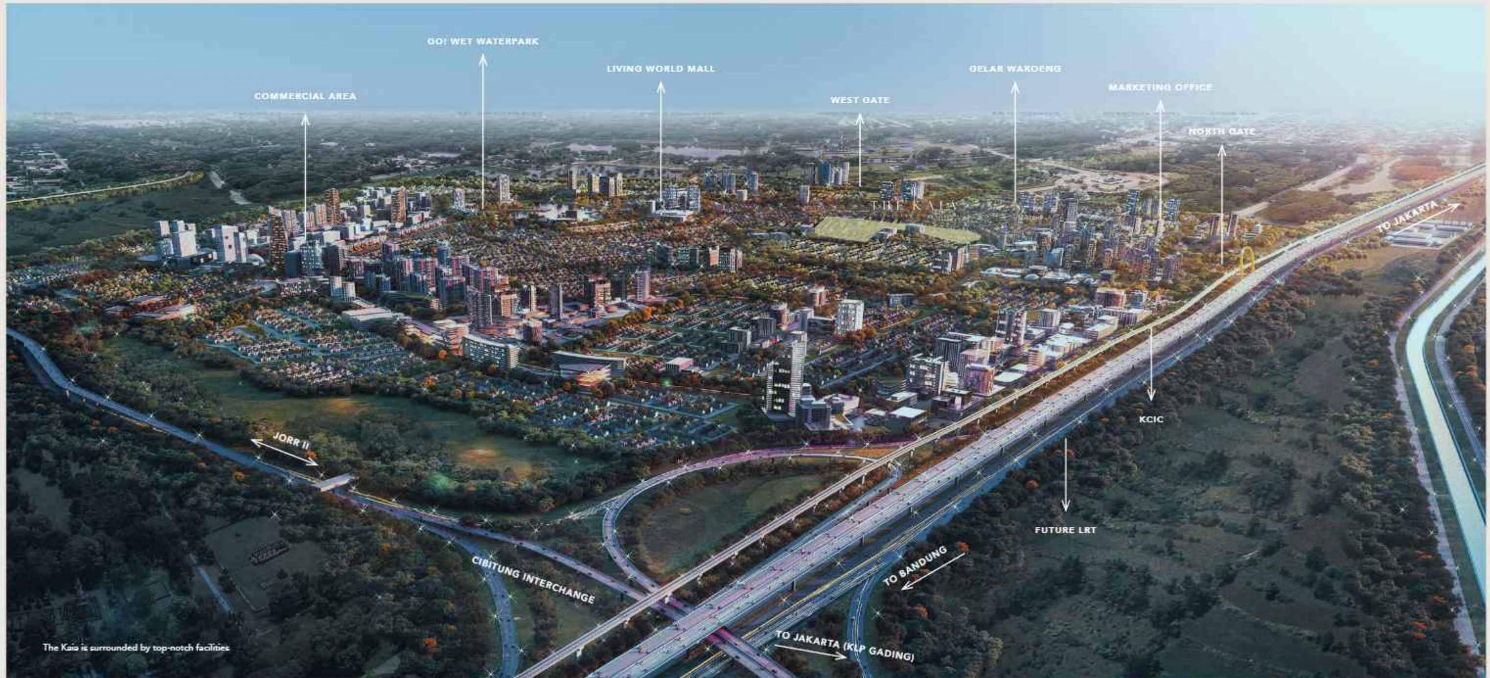
The Kaia is surrounded by top-notch facilities

Supported by major infrastructures, modern transportations and top-notch facilities, The Kaia is surely becoming the number one choice to elevate living.