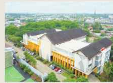
Education Sekolah Islam Al-Azhar IPEKA Notre Dame