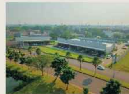
Automotive GW Auto Center