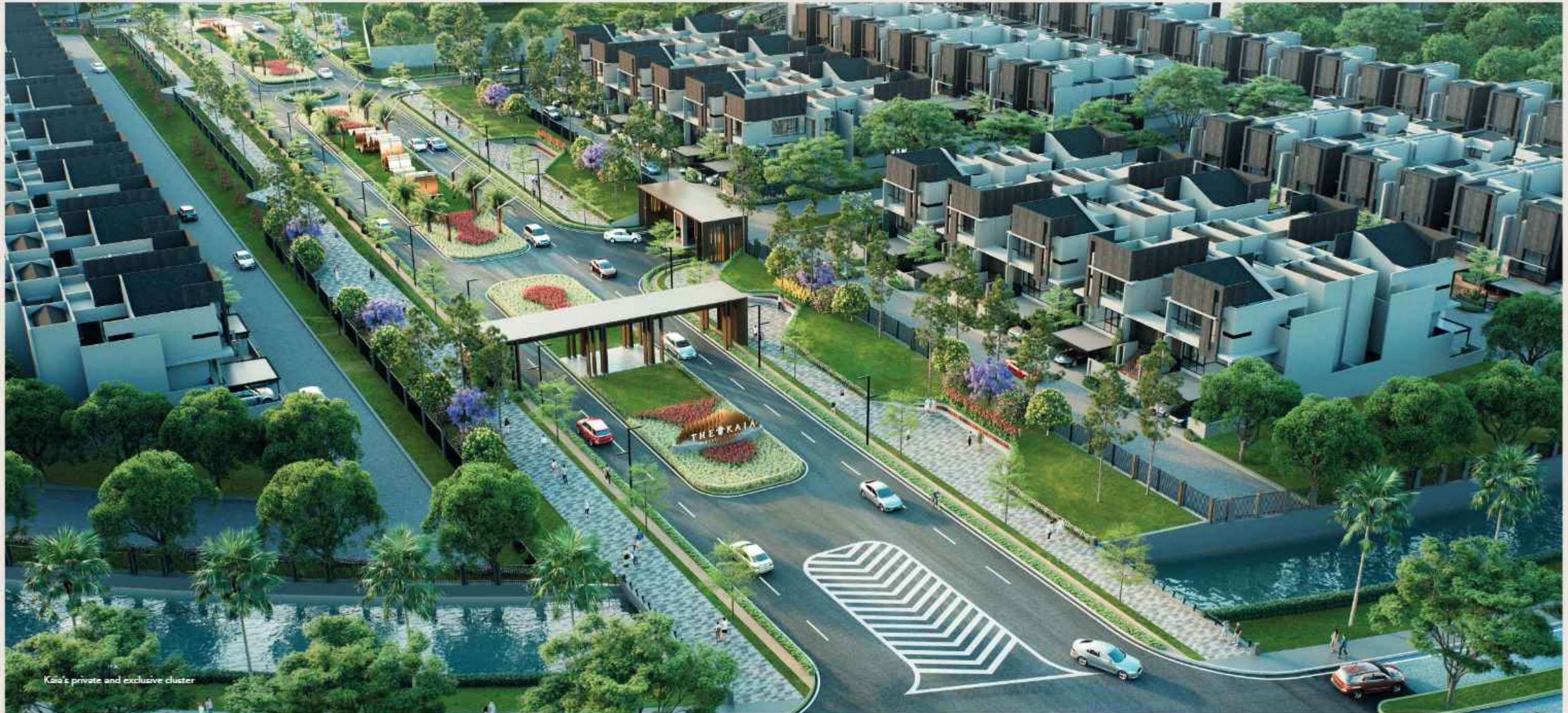
Kaia's private and exclusive cluster

Behind secure gates and amid lush landscapes, residents find solace in The Kaia—an exclusive and private neighborhood.