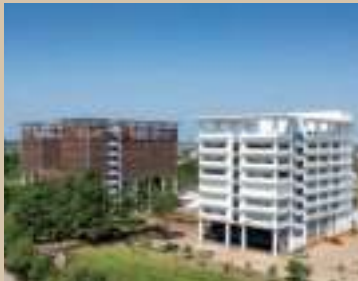
UNIVERSITAS PEMBANGUNAN JAYA

DISCLAIMER: While every reasonable care has been taken in the preparation of this media and the plan attached, the developer and its agent shall not be held responsible for any inaccuracies there in. All statements, specifications and plans are believed to be correct, but not to be relied upon as statements or representation of facts. All floor areas, size and dimensions are approximate measurements only, subject to final survey and using equipment, criteria and method determined by the developer. The developer has the right to determine the schedule phases, design of the project, without prior notice. All photography, art rendering and illustrations contained in this media do not necessarily represent as build standard specifications. All information and specifications are current at the time of going to print and are subject to change as may be required and do not form part of an offer or contract. The developer reserves the right to change the name of the project, building facade, logo or modify the units or any part thereof as may be approved or required by the relevant authorities. Some units may not have all specifications, amenities and or enjoyment described in this media. Please consult to your sales executive for any details and accurate informations.