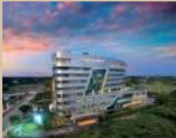
RUMAH SAKIT PONDOK INDAH BINTARO