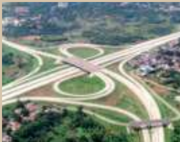
TOL SIMPANG SUSUN PARIGI