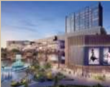
BINTARO XCHANGE MALL