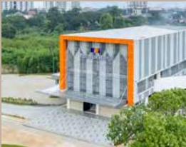
STASIUN PONDOK RANJI