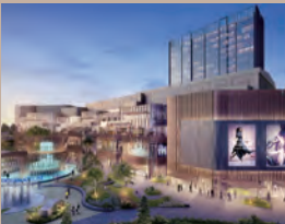
BINTARO XCHANGE MALL