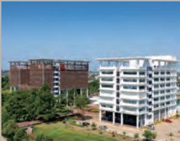
UNIVERSITAS PEMBANGUNAN JAYA