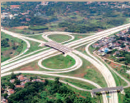
TOL SIMPANG SUSUN PARIGI