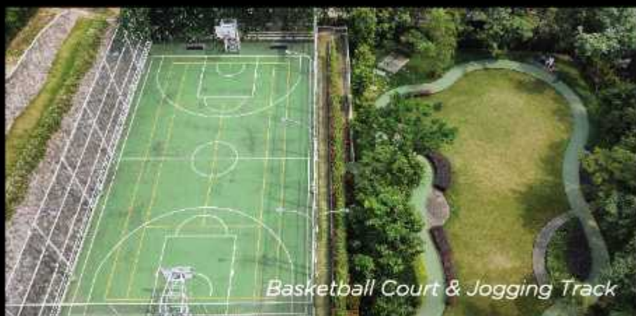
Basketball Court & Jogging Track