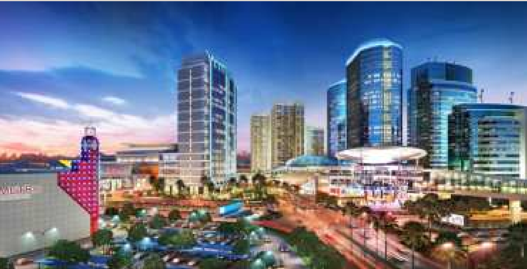
Pondok Indah City Center