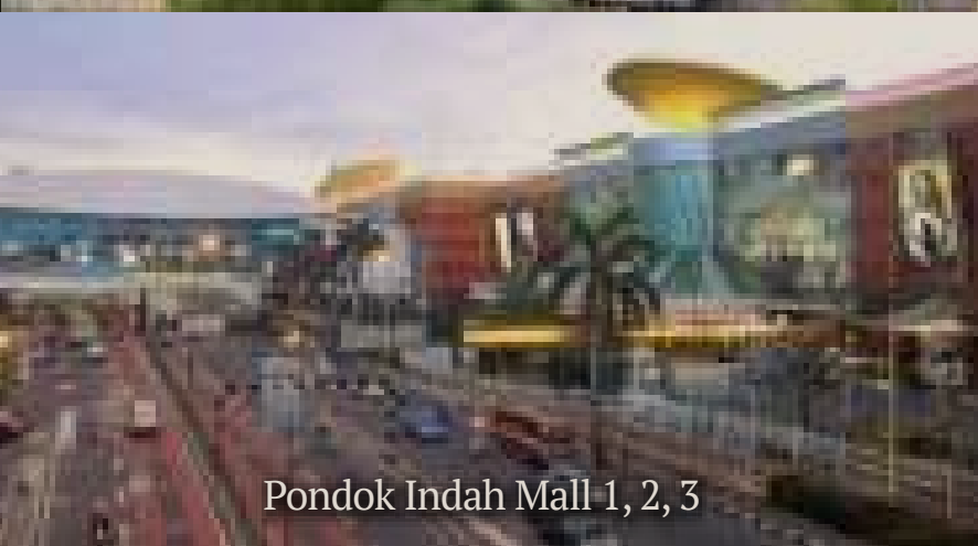
Pondok Indah Mall 1, 2, 3