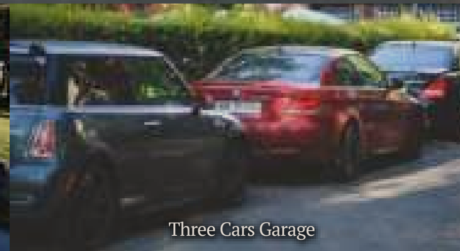
Three Cars Garage