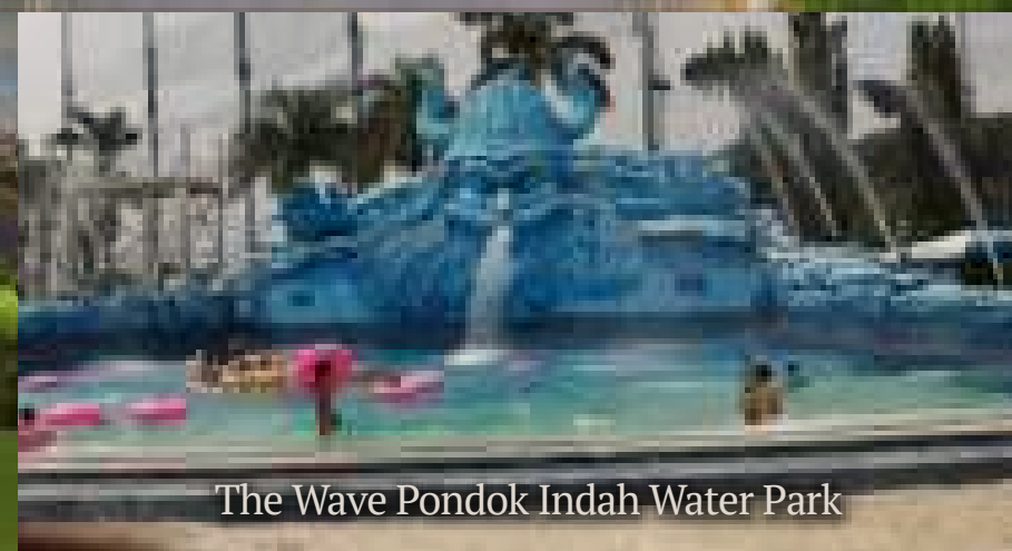
The Wave Pondok Indah Water Park