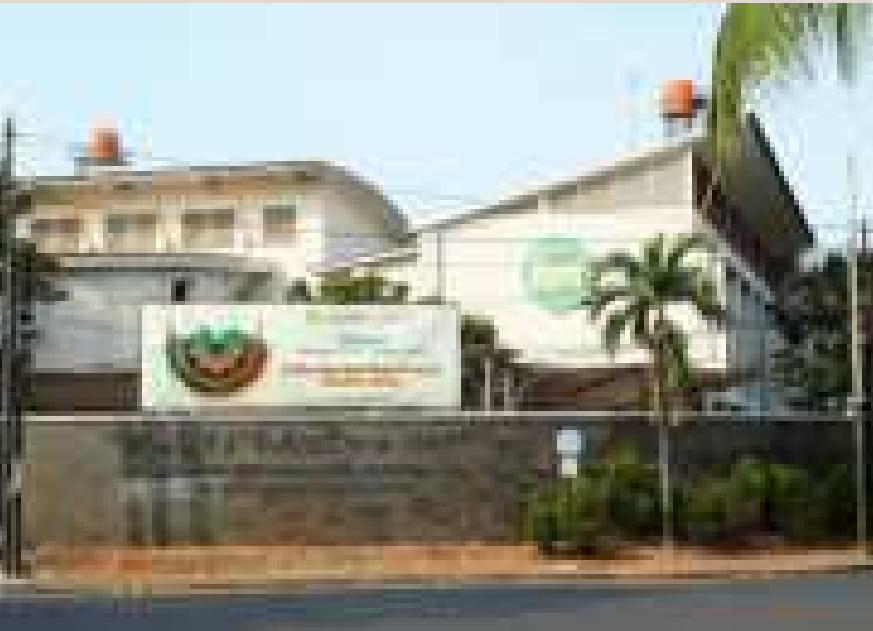
Sekolah Bakti Mulya 400