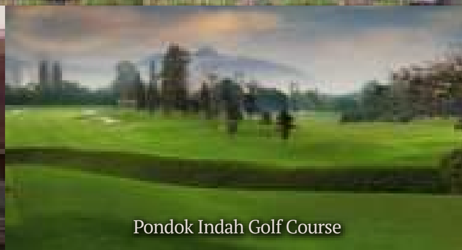
Pondok Indah Golf Course