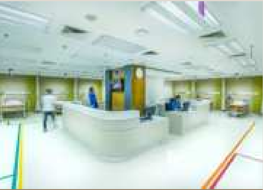
Rumah Sakit Pondok Indah