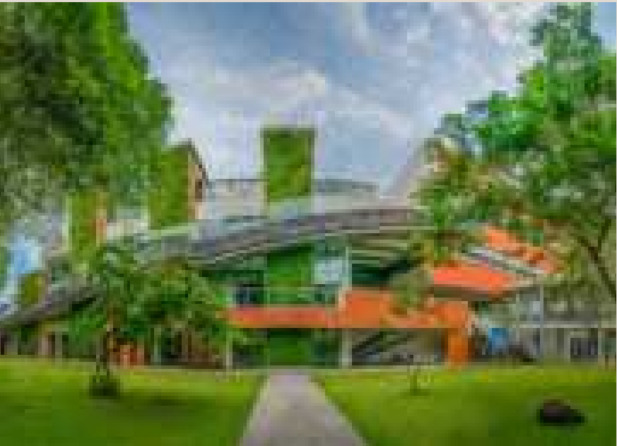
Jakarta Intercultural School