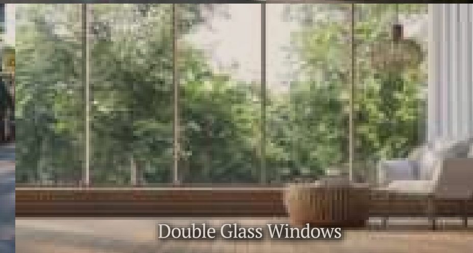
Double Glass Windows