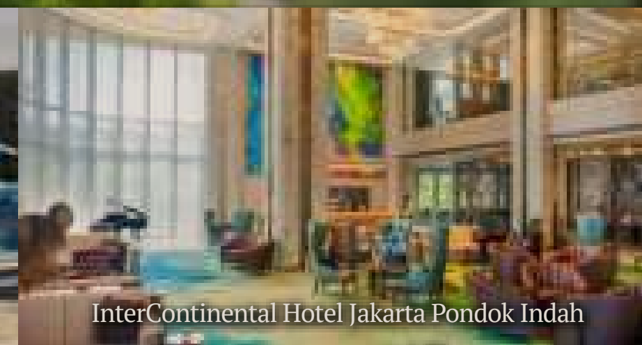
InterContinental Hotel Jakarta Pondok Indah