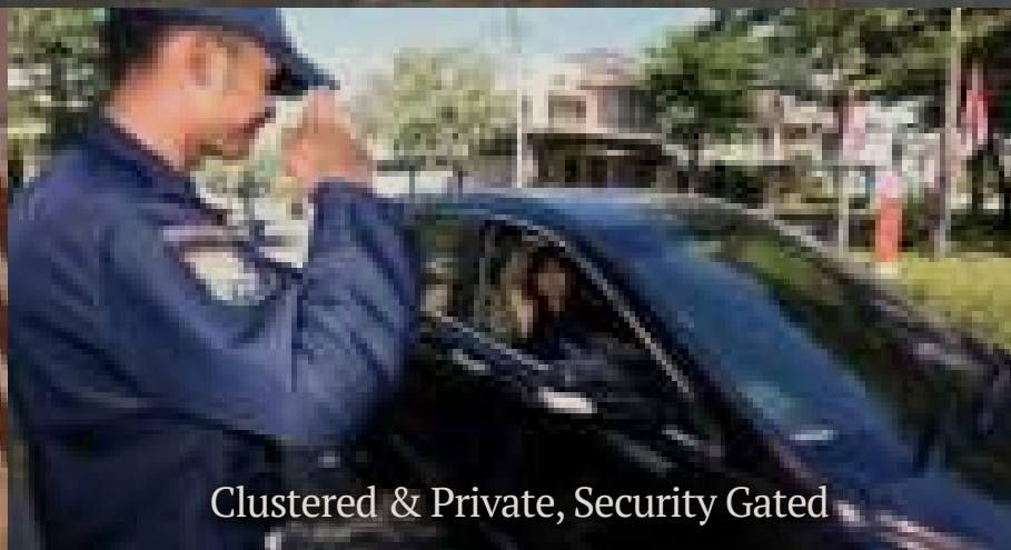
Clustered & Private, Security Gated