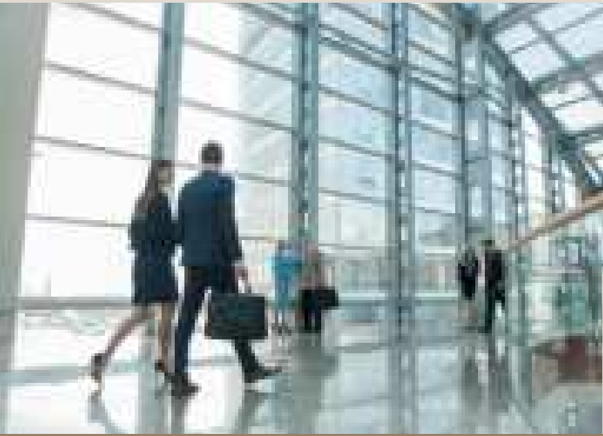
Pondok Indah Office Tower